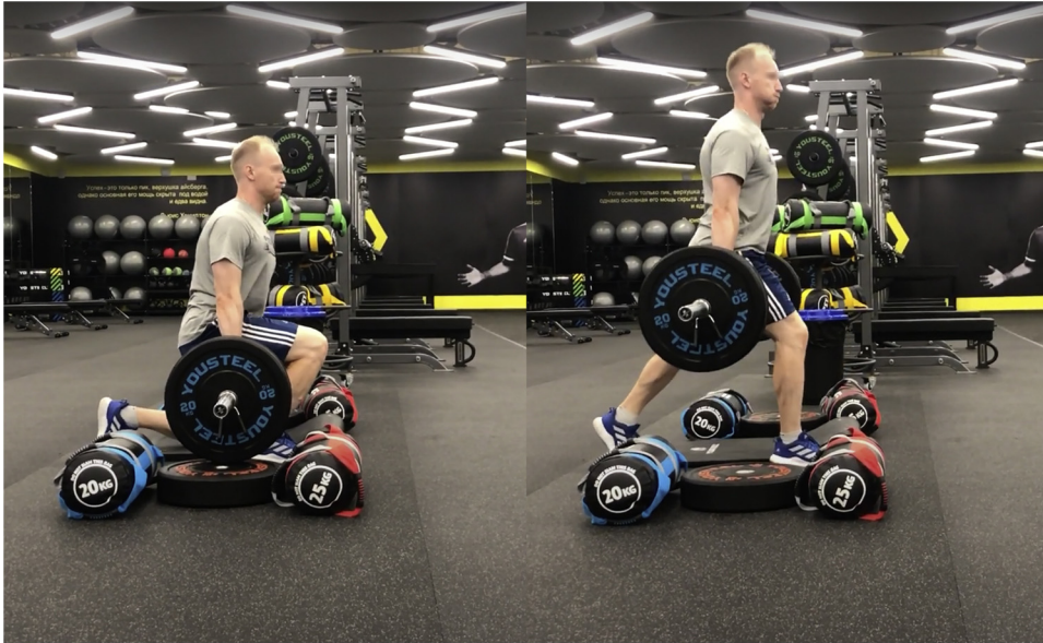
Figure 2 The barbell split-squat test.