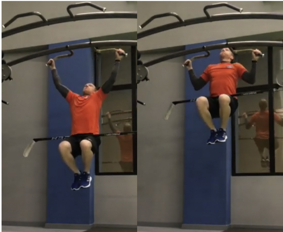
Figure 3 The pull-up test.

using the Pearson product-moment correlation coefficient, is 0.95.